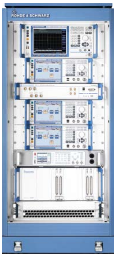
Example configuration: three-channel tester for ATC monopulse radar.

Tester for phase-coherent measurements on radar frontends in development, production and service