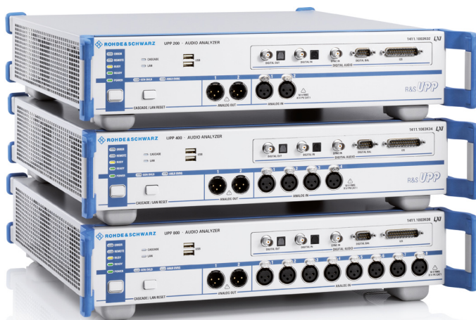
The new R&S®UPP200/400/800 audio analyzer family.

Combining the new R&S®UPP audio analyzers with the R&S®SMB100A signal generators provides the most compact and fastest test solution for modern FM car radios